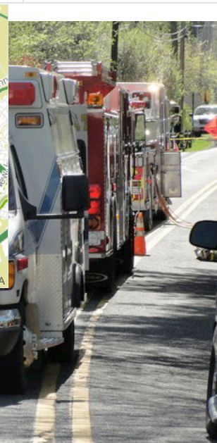
Emergency vehicles stretched for nearly half a mile at the scene.