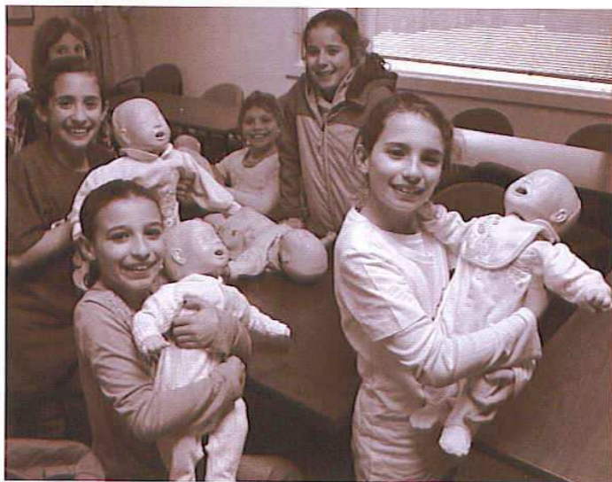
Chatham Troop 1095 cuddled with the infant training manikins following their class