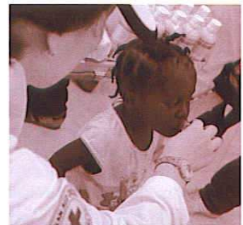
One million Haitians vaccinated

Red Cross is committed to helping Haitians until the last donor dollar is spent improving the citizens' welfare. This is a long-term, multi-year disaster relief effort.