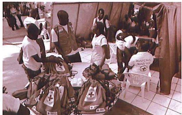
Cholera Education Program in Haiti