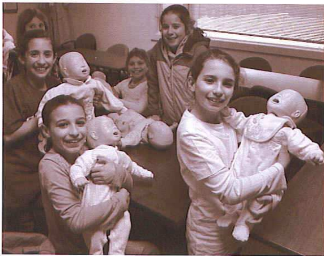
Chatham Troop 1095 cuddled with the infant training manikins following their class