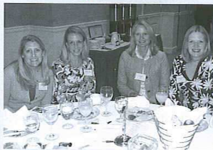
Members of Summit's Junior League at the 2010 Hour for the Red

This free, one-hour breakfast is a wonderful way to learn what the Red Cross does in your community each and every day. Individuals and corporations are welcome.